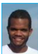
International Volunteer VMY Responsible for English speaking countries

...and Mary gave birth to her first-born son. She wrapped him in swaddling clothes and laid him in a manger, because there was no room for them in the inn (Luke 2:7).